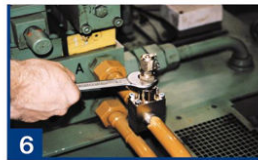
plunge the needle