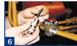
remove stirrup and needle