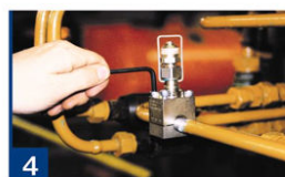
screw down clamp bolts