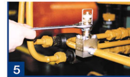
plunge the needle