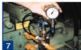
ready to measure