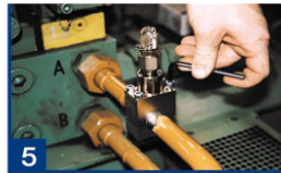
screw down clamp bolts