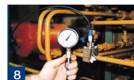
ready to measure