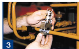
clamp SC onto pipe