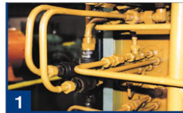
place of installation