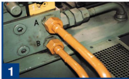
place of installation