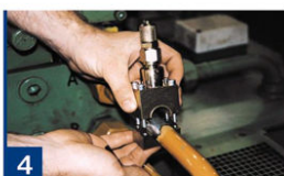
clamp SC onto pipe