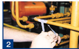
remove paint and clean pipe